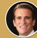
RYAN BLAIR COOLEY LLP