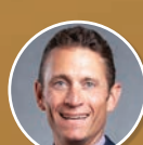
BRANDON SAXON GORDON REES SCULLY MANSUKHANI, LLP