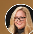
SUMMER WYNN COOLEY LLP