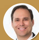
DAVID MAJCHRZAK KLINEDINST PC