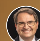
CHAD SHEAR COOLEY LLP