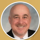
LOUIS GALUPPO G10 LAW, APLC